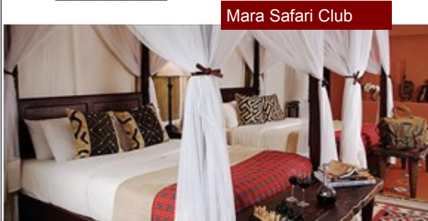
Mara Safari Club